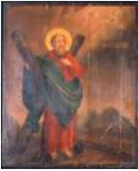
St. Andrew (Nov. 30)

1 Pray. Pray for each team, and its team leader, regularly. Pray for them by name. Pray that they will be given what they need to perform their duties well, and that they will feel supported by the congregation as they do their work.